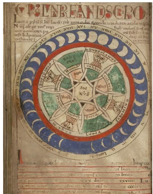
Figure 2. Cursus lunaris et anni descriptio

The inner circles provide geographical and meteorological information. In the red circle there are the terms Oriens , Auster brumalis , Occidens solsticialis and Solstitium , which stand for descriptions of the cardinal directions. The next, uncoloured circle gives the names of winds as described by Seneca (1998) and Isidore of Seville (2008), with Subsolanus , Favonius , Nothus and Septentrio . The following circle shows pictures of the winds alternating with the description Dies , Solis occidens , Nox , Solis ortus . The next circle gives the names of the four qualities calidus