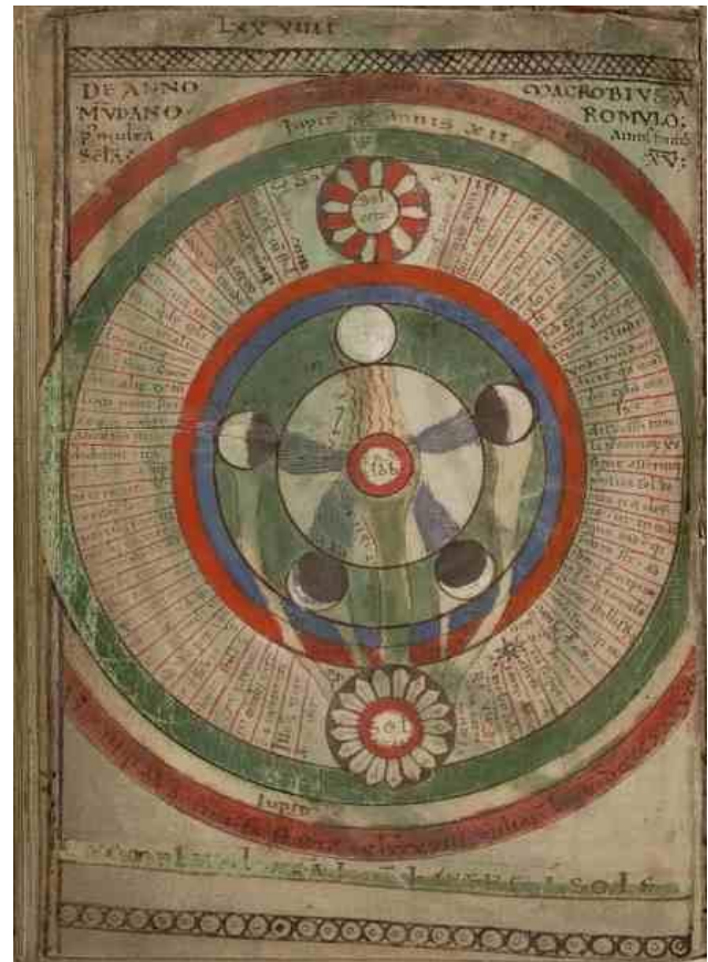
Figure 3. De anno mundano

This folio (Figure 3) deals with the "mundane year", a concept already vaguely described by Platon (Timaios, 39d), again by Cicero in his Somnium