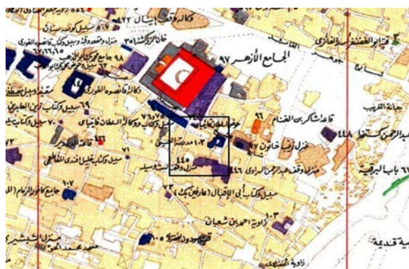
Figure 2. The location of Prince Mithqal al-Saqy house. (From Cairo map of Islamic archeology, fig. 2, Egyptian Space Department, 1951).

Zainab Khatoun house is located at the corner of the intersection between Al-Aini alley and Al-Azhar street (Mohamed Abdo now), on the right of passersby (Mubarak, 1305 A.H., Vol.2, p.92). In front of Al-Aini School 1411 A.D. [2], that is opposite to it on the western façade (Fig. 2), which was located by Ali Mubarak at the edge of Al-Dawadary alley on Al-Aazhar Mosque line on the right of the alley entrance (Mubarak, 1305, Vol. 6, p.10). This is different from the location of Mithqal al-Sodouny house mentioned in the document at hand.