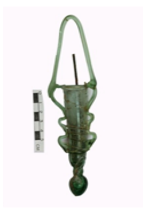
Figure 13. Cosmetic tube with basket handle

Fig. 14 . Single-compartment cosmetic tube with a base and a double basket handle; made of blown green glass.