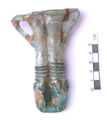
Figure 2 Cosmetic tube two-handles

For parallel examples see: Sary 1991: 9, pl. 2 c; Whitehouse 2001: 194, Fig.745; Hayes 1975: 101, Fig 359.