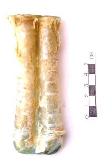
Figure 1 Cosmetic tube

For parallel examples see: Whitehouse 2001:192, no. 724; Fleming 1997:34, no.21; Hayes 1975:117, no 454.