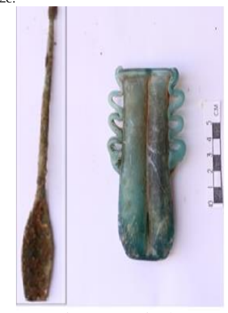
Figure 3 Cosmetic tube

For parallel examples see: Sary 1991: 9, pl.2c.