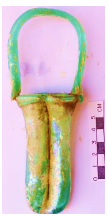
Figure 7 Cosmetic tube with basket handle

Fig. 8 Double-compartment cosmetic tube, handle is missing; made of blown green glass.