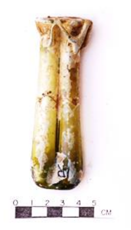
Figure 5 Cosmetic tube with two handles

For parallel examples see : Fleming 1977: 35, fig24; Dussart 1998: 173-174, pl.57,no. 19