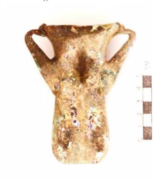
Figure 4 Cosmetic tube with two handles

For parallel examples see : Hayes 1975: 101,Fig 359; Dussart 1998: 174, pl.57,no. 24; Whitehouse 2011: 194, no. 745; Seligman et. al. 1999: 53, Fig. 17, 2.