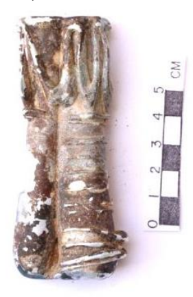
Figure 12. Cosmetic tube with handles

For parallel examples see: Hayes 1975: 101, no. 360-361; Hadidi 1979: 134, LIII fig 8,255; Fleming 1999:106, no 107; Husseini 1935: 176, PILXXXV, 3.