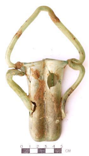
Figure 10. Cosmetic tube with basket handles

For parallel examples see: Hayes 1975: 118, no. 458; Whitehouse 2001:196, no749.