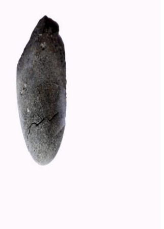
Figure 18 Sample of the kohl paste from cosmetic tube no. 3 (IR 6658).