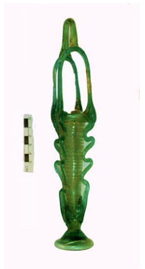
Figure 14 Cosmetic tube with single compartment

For parallel example see: Fleming 1999:120,Fig E63; Whitehouse 2001: 194 no,746.