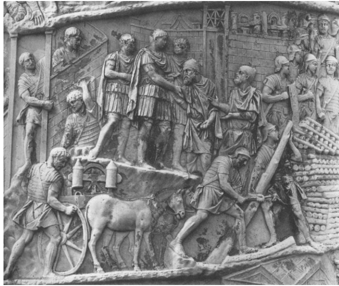
Fig. 2: Here the ballista is drawn by mules during the Roman preparation of a fortified enclosure during the Dacian war (Coarelli, 2000: 115). The picture is taken from Trajan's Column