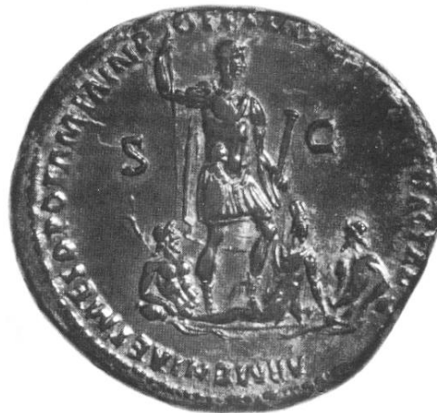
Fig. 1: The emperor Trajan stamping down Armenia (Hannestad, 1979)