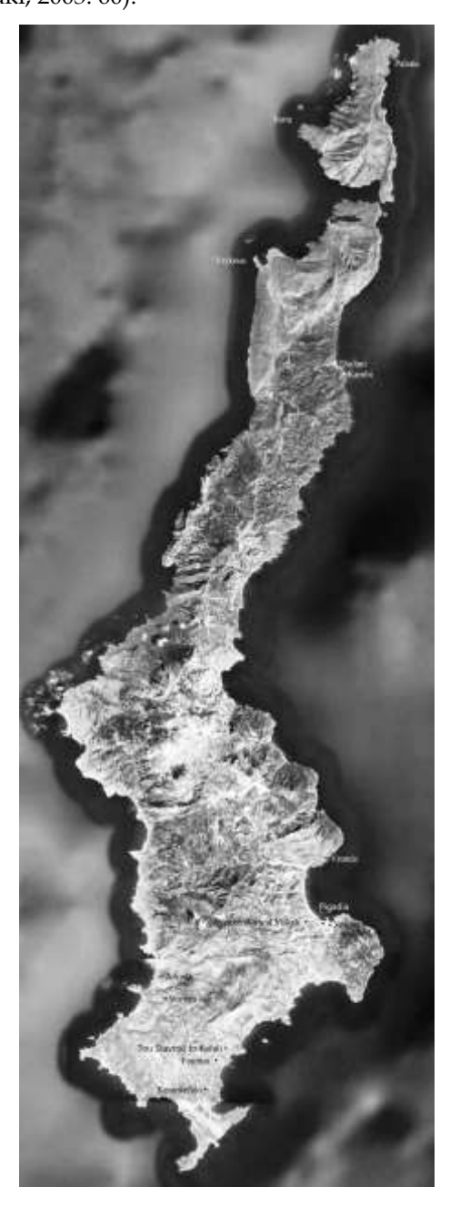
Figure 2. Satellite map of Karpathos and Saria with sites mentioned in the text (Source: Google Earth, Image Landsat/Copernicus, Data SIO, NOAA, U.S. Navy, NGA GEBCO).

south, which has been interpreted as a harbour town of considerable size, enjoying some level of prosperity resulting from its involvement in maritime trade. The prominent place held by Pigadia, in a landscape dotted by hamlets and farmsteads, has been recognised as an indication for proto-urbanism which developed with the impetus of trade and industrial activities, such as ceramic and textile production, partly attributed to the arrival of Cretan settlers (Melas, 1985: 161, 162). Evidence of architectural remains at Manolakakis' Land in Pigadia also exhibits Cretederived traits, such as the presence of red-wall plaster, which is further associated with a deposit of household debris containing Minoan pottery, such as conical cups and fragments of tripod vessels and hole-mouthed jars (Melas, 1985: 29; Davis, 2001: 71; Zervaki, 2003: 60).