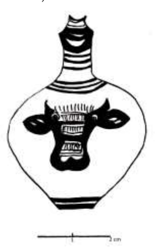
Figure 4: LH III A 1 beaked jug decorated with bucranium (drawn by M. Mina, after Charitonidis, 1963: no. 22, fig. 5).

2003: 189). The typological traits of the pottery found at Avlona suggest that products of Minoan and Helladic workshops arrived in equal amounts on Karpathos during the later part of fourteenth and the early part of the thirteenth centuries BC, owing to the key position the island held at the intersection of sea routes of the eastern Mediterranean (Platon and Karantzali, 2003: 200).