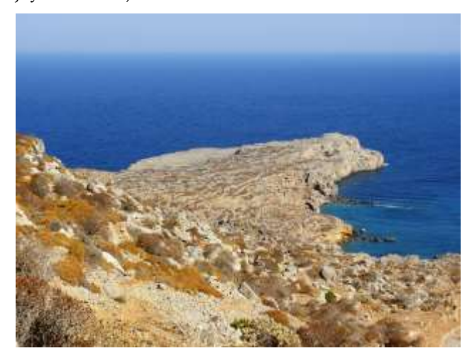
Figure 3: View of Vrykous.

floor exposed at the Tsekou plot in Pigadia produced a large quantity of pottery of LM/LH III date, some of which may have been imported from either Crete or the mainland, exhibiting affinities both with vessels from Rhodes and Palaikastro on Crete (Zervaki, 2003: 64). The assemblage also includes locally made utilitarian pottery which suggests that, although the local household maintained contact with major centres of the time and imported and imitated fine ware, they nevertheless chose to cook in their own local vessels (Zervaki, 2003: 65). Mycenaean sherds are also attested in the north of the island at the site of Vrykous (Figure 3) (Hope Simpson and Lazenby, 1962: 161). Evidence dating to the LM/LH IIIB phase, shows a decrease in the distribution and numbers of Mycenaean pottery on islands of the southeast Aegean, suggesting a continuing but decreased Mycenaean presence in the region (Mountjoy, 1993: 173).