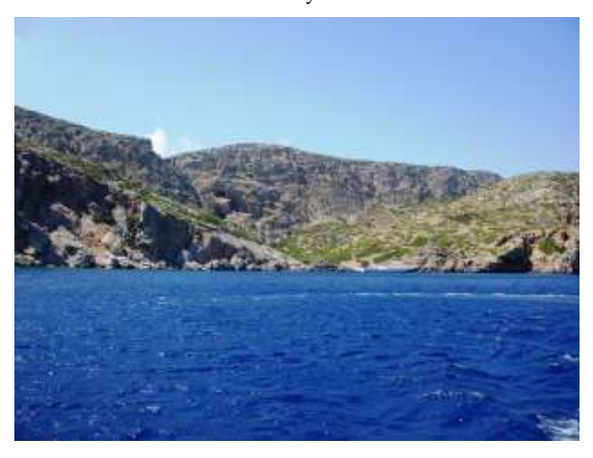
Figure 1: View of Saria from the sea.

In the present paper, we discuss together the processes of Minoanisation and Mycenaeanisation in order to explore cultural dynamics in the later Middle Bronze Age (hereafter MBA) and Late Bronze Age (hereafter LBA) in the southeast Aegean. We are aware, however, of the diverse historical circumstances at play during the Minoan and Mycenaean floruit, and of the varying degrees to which political, economic and institutional forces shaped the networks of cultural connectivity in the southeast Aegean. The discussion that follows, therefore, is intentionally Karpatho-centric in addressing specifically the ways in which local communities entered a dialectic relationship with off-island cultures, which resulted in a distinct identity.