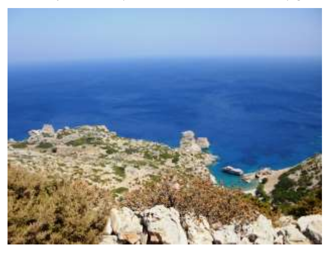
Figure 5: View of the Avlona plateau (Photograph by S. Phillips).

LBA metal objects known from Karpathos also demonstrate close cultural affinities to their counterparts from Crete, which replaced the prevalent Anatolian and Levantine traditions of the earlier metal implements (Melas, 1985: 148-153). The assemblage of metal finds includes four swords (nos. 39, C102, C101, 1273), five spearheads (nos. 25, 37, 38, C105), a knife (no. 40) and a razor (no. C103) (Melas, 1985: 148-153). The swords parallel MM II-III examples from Mallia, Kakovatos Tholos B, Arkalokhori, Knossos, Farmakokephalo in Siteia, the spearheads parallel counterparts from Knossos and Mochlos, and the knife resembles examples from east Crete and Mallia (Melas, 1985: 151-153 with references).