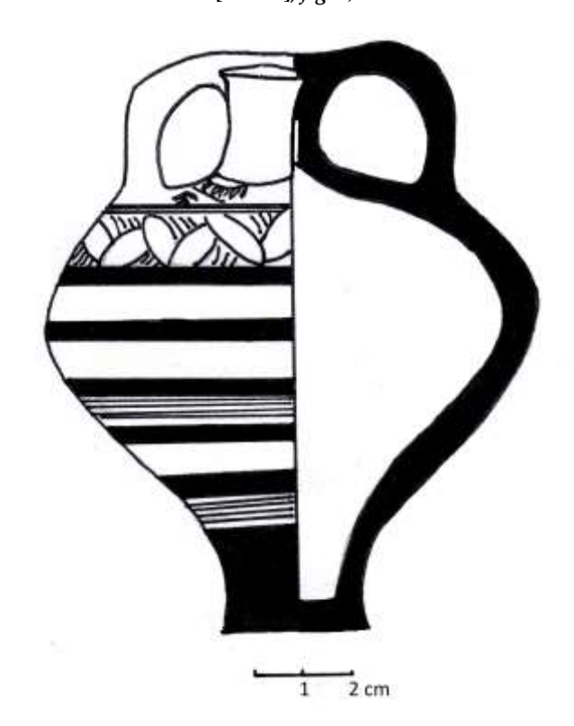
Figure 7: LM/LH III A1/2 miniature stirrup jar (drawn by M. Mina, after Zachariadou, 1984: 257, no. 32 [П6877], fig. 5).

Textile production also suggests the influence of Crete-derived cultural tradition (at the production and possibly consumption level), as indicated by Minoan-type loomweights recovered from sites near the coast (Davis, 2001: 71). The use of Cretan-style discoid loomweights with a flattened or grooved top on LBA Karpathos suggests that the associated technical knowledge may have in fact been acquired through contact with communities already familiar with the use of the Cretan type loomweight, although direct contact should not be dismissed, at least in the earliest period (Cutler, 2016: 175). Once the necessary skills were acquired, they could then be passed on through vertical transmission from one generation to the next, eventually forming part of the local technological tradition (Cutler, 2016: 175).