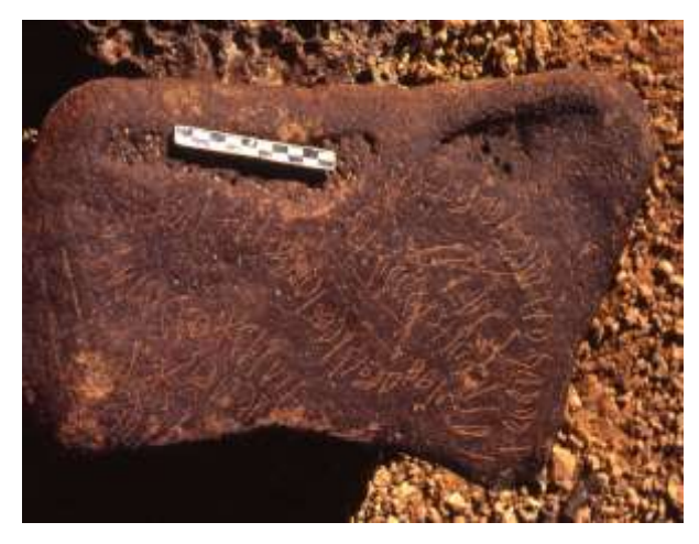
Figure 3. The stone which bears this inscription