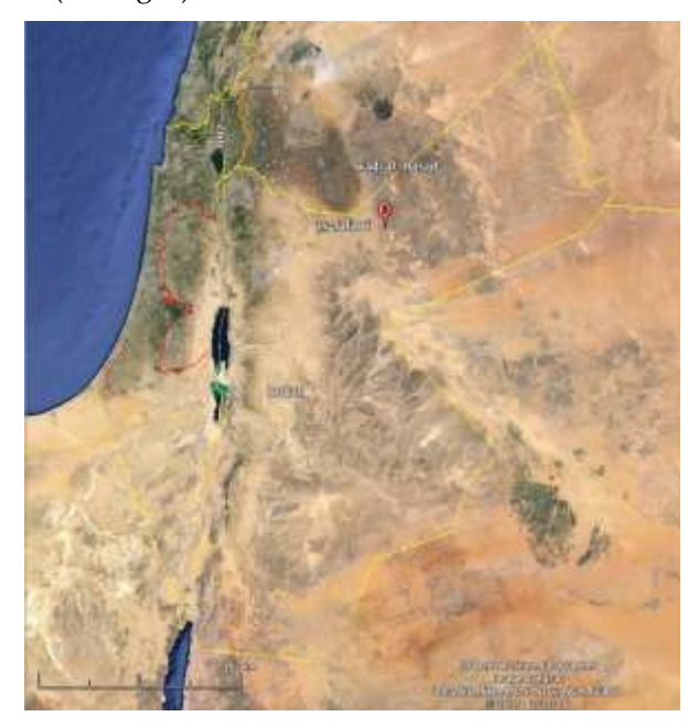
Figure 1. Map of Jordan showing the location of Wadi al-Hašad

The stone which bears this inscription was found in Wadi al-Hašad and is situated about 45km northeast of the village of as-Safawi, formerly known as H4 (see Fig. 1).