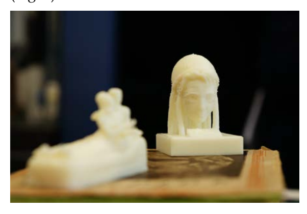
Figure 3 "Ati": 3D printing test for hypothetical merchandise.

can also be successfully joined to merchandising activities. Moreover it is possible to foresee, in addition to the sale of a DVD, containing the 3D movie and its making-of, different gadgets such as "Ati"'s action figures in order to create not only economic outcomes, but also communication ones (Fig. 3).