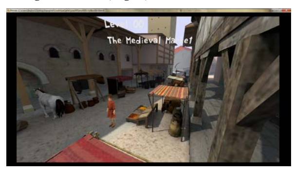
Figure 4 "ApaGame": the Medieval market level (under construction).

mented reality Mobile apps, assets born for being rendered (Fig. 4).