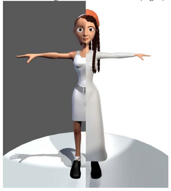
Figure 5 "Ati": from the CookieFlexRig character to "Ati"

As for "Ati", the main character is a total novelty compared to "Apa" and largely relies upon the increasingly vast resources made available by the Blender community, such as those coming from Blender Cookie (http://cgcookie.com/blender/) or Blend Swap (http://www.blendswap.com/) and from the wide selection of avatars that, inside an Open perspective, can be customized according to the various needs (Fig. 5).