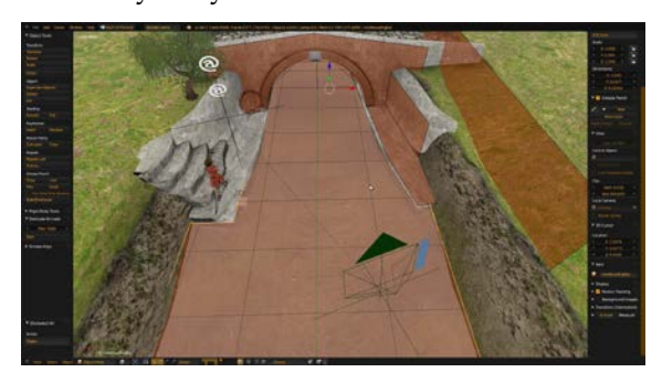
Figure 6 "ApaGame": the Roman bridge level seen in Blender while setting the bounding boxes.

"ApaGame" is designed as a small magnet for locals and tourists, transmitting, on the one hand, knowledge about the city and its daily life in the past and, on the other hand, trying to attract people to the nowadays city.