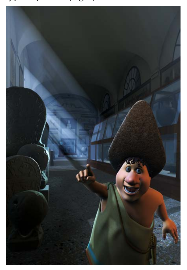
Figure 1 "Apa the Etruscan": the main character inside the Bolognese Archaeological Museum.

must not remain as isolated monads, but should become nodes in expanding networks. The experience started with the project "Apa the Etruscan" fits perfectly in this type of process (Fig. 1).