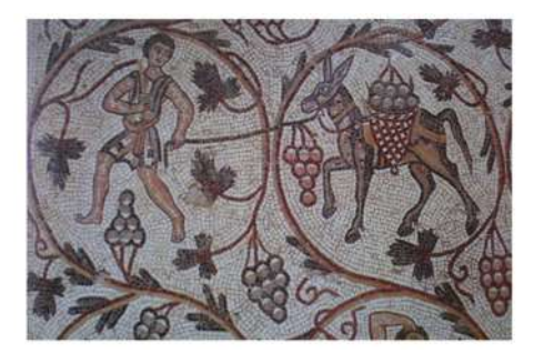
Figure 9. Peasant carrying the grapes, The Church of the Deacon / Mount Nebo- Uyun Musa ,

The second location is in the Uyun Musa, there are only one example from the loction was found on the floor of the Church of the Deacon Thomas Musa (fig. 9), dated to the Byzantine period (Piccirillo 1989, 216-223; 1997, 180, 187, Pl. 253). Here, the peasant is looking at the donkey; he is wearing a grey chiton with a dark black outline, and his belt is red and a dark red outline. This peasant is without shoes on his feet. He holds in his left hand a rope leading to the donkey. In his right hand, he is holding a long stick, which he puts on his chest. It is colored light red. The donkey is walking behind the peasant, and is looking forward; it is