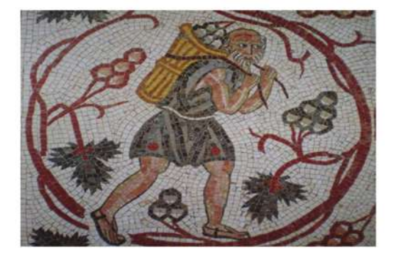
Figure 10. Peasant carrying grapes, Church of the Holy Martyrs Lot and Procopius Mukhayyat/ Mount Nebo

There are two examples from Mukhayyat location at Mount Nebo, the first on the floor of the Church of the Holy Martyrs Lot and Procopius (Fig.10), which dates to AD 557 (Saller and Bagatti 1949, 39-41, 55-67; Piccirilo 1997, 152, 164, Pls.202, 205). Here, the old peasant standing between a scroll of leaves and fruits of the vine. He is wearing a gray chiton with a dark black outline. His face is oval, and his wide and dark eyes are looking forward; his bald head is hairy and hoary, as is his chin. Finally, he is wearing slipper and his fingers are appeared on his feet. The peasant carries on his back a basket filled with grapes that are grey with