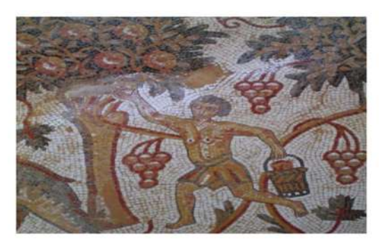
Figure 6 Peasant cutting pomegranate

holds cut pomegranates, while in his left hand, he is carrying a basket. The basket is colored red and dark black; the peasant, basket, scroll of leaves of grapes, and the pomegranate tree are all set against a white background.