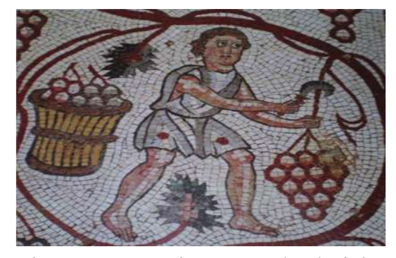
Figure2. Peasant cutting grapes, Church of the Holy Martyrs Lot and Procopius Mount Nebo-Mukhayyat

He holds in his right hand a sickle to be used for cutting off a bunch of grapes. His left hand is holding a bunch of grapes. Behind the peasant there is a basket full of dark red and black grapes; the basket is colored red and dark black, while the center of the basket, features vertical slides painted dark yellow. The inner of the center is horizontal and is colored red and dark black. The peasant, basket and scroll of leaves and grapes are all featured against a white background. The second example from Mukhayyat is on the floor of the nave of the lower Chapel of the Priest John at Mount Nebo-Mukhayyat (Fig. 3), which dates to the second half of the fifth century AD (Piccirillo 1988, 297-315; 1997, 176, Pl. 235). Here, we find more curvature with the peasant than with the one in the Church of Saints Lot and Procopius and in the Church of the Deacon Thomas. The peasant is looking forward; also, the configuration of the sickle is different from that in the other examples, it is at the head to right foot of the peasant, whereas the left hand, which is holding a bunch of grapes, drops partly within the basket. Additionally, here, the basket is filled with dark red and black grapes.