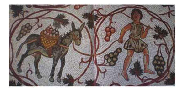
Figure 7. Peasant carrying the grapes, Church of Saint Lot and Procopius, Mukhayyat/ Mount Nebo.

location in Mukhayyat and the second location from Uyun Musa. The first, has two examples, the first one is on the floor of the Church of the Holy Martyrs Lot and Procopius (fig. 7), dated to 557 AD (Saller and Bagatti 1949, 39-41, 55-67; Piccirilo 1997, 152, 164, Pl. 203).