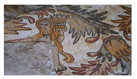
Figure 11. Woman carrying grapes, Upper Chapel of the Priest John Mount Nebo-Mukhayyat

a dark outlines. The basket is dark red and yellow. The peasant, basket, scroll of leaves and grapes are against a white background.