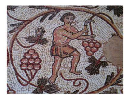
Figure 4. A grape cutter, Church of the Deacon Thomas at Mount Nebo-Uyun Musa.

Thomas (fig. 4) dated to the Byzantine period (Piccirillo 1989, 216-223; 1997,187, Pl. 253),; here, however, there is no basket as in