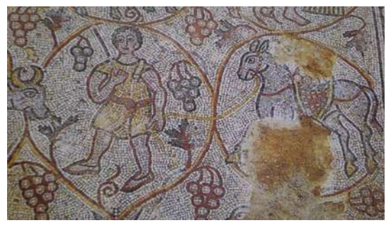
Figure 8. Peasant carrying the grapes, The Lower Chapel of the Priest John Mount Nebo- Mukhayyat

walking behind the peasant, is looking forward, and is carrying a basket decorated with horizontal and vertical lines in dark red and black and with a white outline; it is filled with grapes. The images of the peasant and donkey are drawn against a white background of mosaic pavements, as in the previous example.