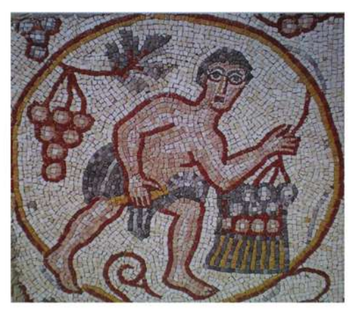
Figure 3. A grape cutter, the lower chapel of the Priest John, Mount Nebo-Mukhayyat.

The second locution (Uyun Musa – Mount Nebo) has two Churches are included a scenes of peasants harvesting grapes, the first example is on the floor of the nave of the Church of the Deacon