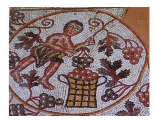
Figure 5. A grape cutter: The Lower church of Kaianus-Uyun Musa

dating back to ancient periods. It was used in the arts, especially in frescos during the Roman era. The study is focusing here on the use of pomegranate figures used in harvest scenes. Byzantine artists incorporate pomegranate scene in these drawings. In general, the researchers find the existence of such scenes to have greater significance than scenes of the fruits of the vine, as they highlight everyday life. There is also the religious significance based on the Bible where the pomegranate symbolizes charity, as it spreads seeds when it blooms. Scenes of peasants cutting pomegranates are generally less common then similar scenes of the fruits of the vine, although we do find scenes featuring pomegranate in many churches, both in Jordan and in nearby areas; one site from our study contains a featuring harvesting scene the of pomegranates.