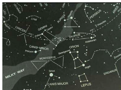
Fig. 1. The intersection of the Milky Way and the Zodiac – the path of the Planets – where stood the gates of the afterlife according to Macrobius. (Planisphere: Heifetz)

In support of this theory, we have the Commentary on the Dream of Scipio , where, as we've seen, Macrobius locates the portals to the beyond at the intersections in the sky (Figure 1) – following Cicero, who had followed Plato.