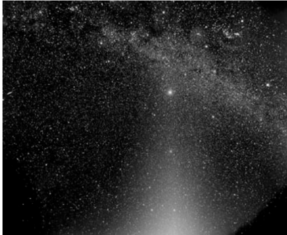
Fig. 4. The zodiacal light rises from the horizon, envelops planets along the ecliptic, and intersects the Milky Way

ible – to those who know when to look, in what season and at what time of the night (Figure 4).