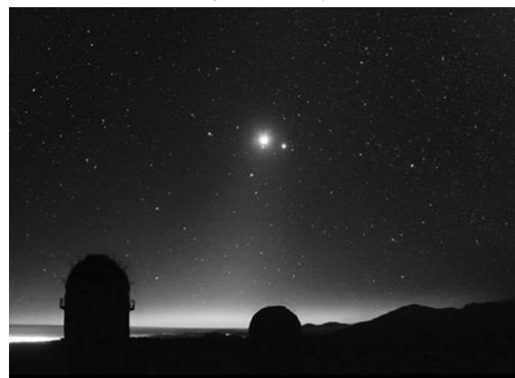
Fig. 5. Zodiacal light rises from the horizon and envelops the crescent Moon and planets, at Skinakas Observatory, Crete, October 7, 2007.

The torch-lit procession was followed by a pannychis – an all-night vigil that was a common feature of Greek festivals (Parker 2005, p. 166) and suggests an astronomical connection. Since the zodiacal light only appears for a short period before sunrise in the fall, a night-long vigil would ensure that initiates would be awake to witness the miraculous sight shortly before dawn.