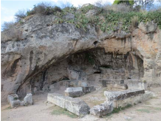
Fig. 2. Semi-spherical cave of Hades, portal to the world beyond, at Eleusis today, about 18 kilometers outside Athens.

where the gates to Hades are. (Athanassakis, Wolkow, 2013, p. 19)