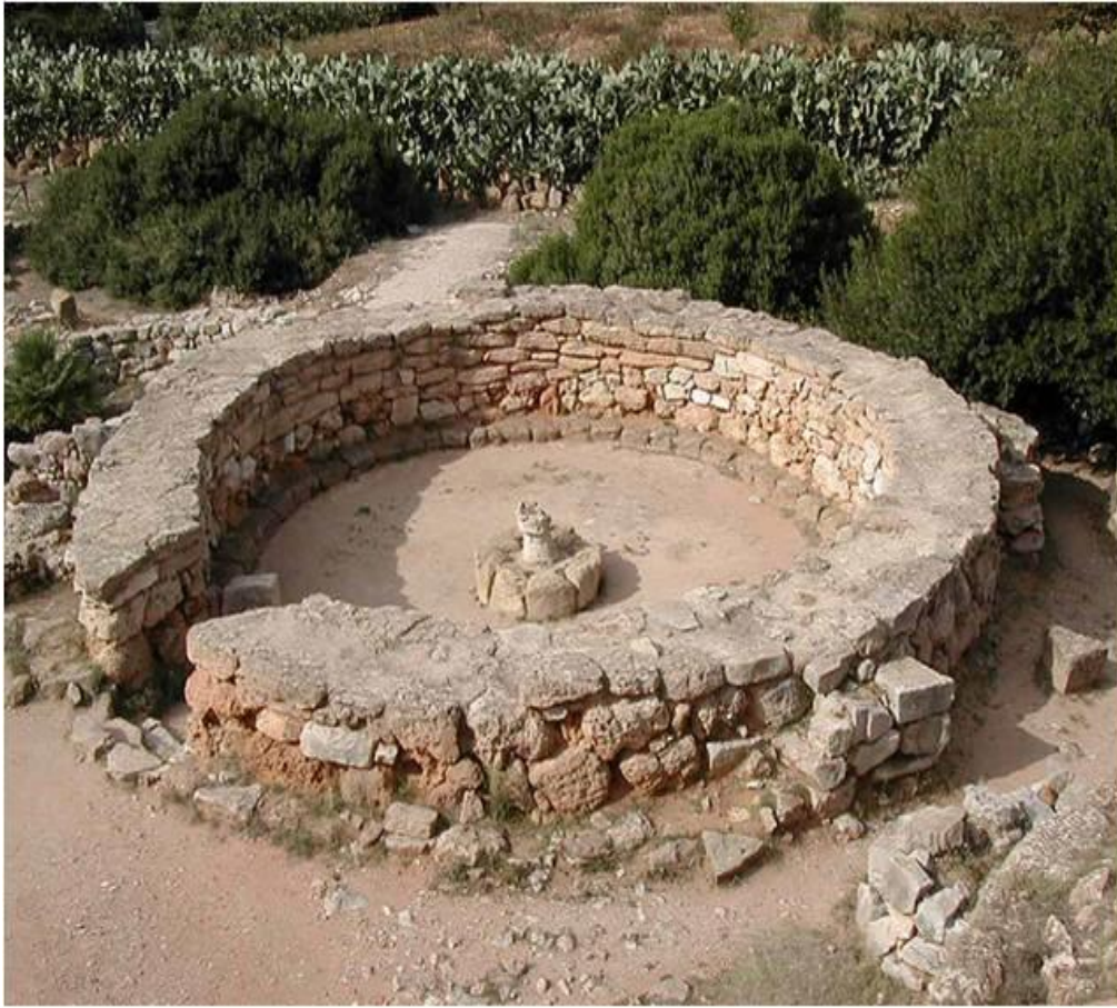
Figure 2. Meetings hut , Palmavera, Alghero