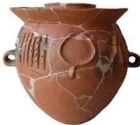
Figure 5. "Olla biansata" found on the central fireplace of the meetings hut La Prisgiona, Arzachena.