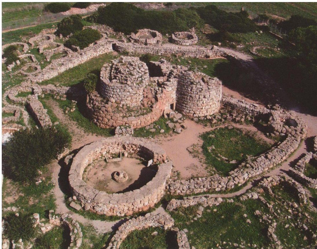
Figure 1. Nuragic village at Palmavera, Alghero.

Very few scientific papers were written about these building, and the most interesting is Patrizia Fenu's paper (2008). In our survey we have measured the orientation of the axis of the entrance (from inside to outside) of the "meetings huts" mentioned by Patrizia Fenu (2008). These represent almost the totality of the "meetings huts" discovered so far.