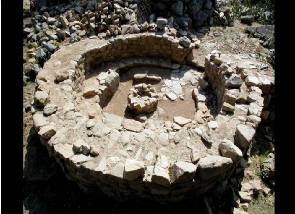
Figure 4. Meetings hut, La Prisgiona, Arzachena