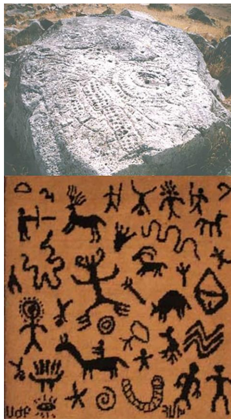
Figure 2. Examples of the Armenian rock art

2014; Danielyan, 2014; Eynatyan, 2014; Harutyunian & Mickaelian, 2014; Mirumyan, 2015). Among his 29 works, 13 have relation to astronomy (calendars, tables, papers about Earth, Moon and sky). His views were rather advanced for his time. A webpage dedicated to Anania Shirakatsi is available at ArAS website ( www.aras.am/FamousAstronomers/shirakatsi.html ).