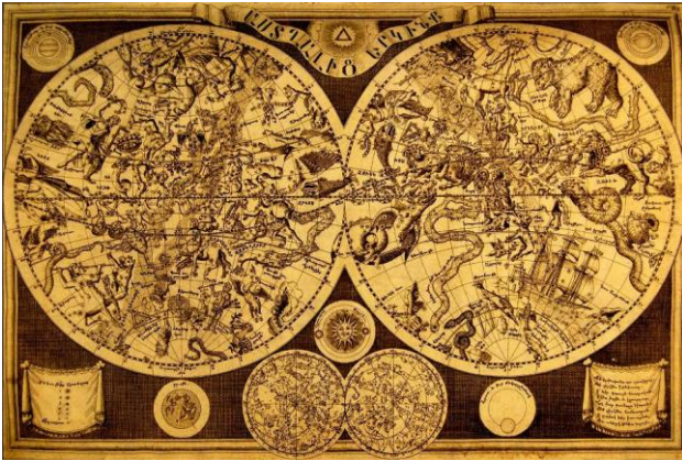
Figure 3. Armenian medieval sky map "Astghalits Erkinq" by Mkhitar Sebastatsi (1749)