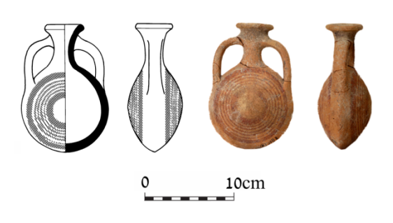
Figure 1. Example of a small flask (no. 2267 from Tell Qasile)

with a volume of circa 50 ml (Fig. 1). They are made of a rather coarse fabric and are usually decorated with simple concentric circles in one or two colors. However, even though they are quite humble in appearance, their decoration stands in contrast to the very dull and unadorned vista of Phoenician pottery of the early Iron Age. In fact, the small flasks and the Bichrome containers are the only ceramic vessels in Phoenicia that were systematically decorated (Gilboa, 2005, Gilboa and Sharon, 2003). This suggests that their decoration had a specific function, possibly because they were meant to be 'marketed'. Furthermore, most of the small flasks have walls around 1cm thick (Fig. 1) that are much thicker than those of all other contemporary Phoenician ceramic vessels. This presumably represents a special effort to avoid breakage. Indeed, many of them survived intact, even in the habitation contexts of stratified tells, making them good candidates for residue analysis.